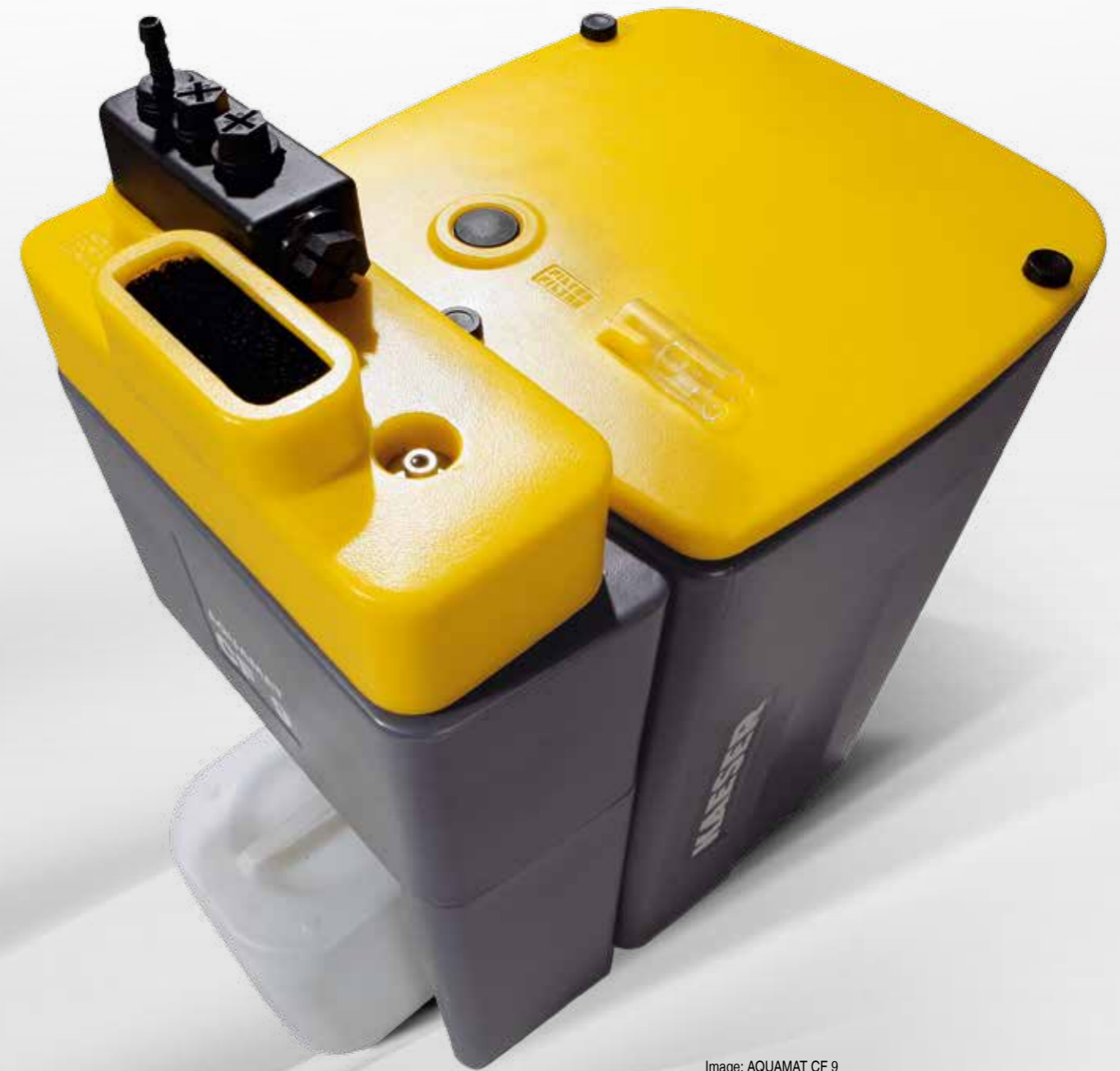
Image: AQUAMAT CF 9